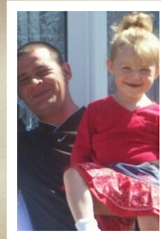
my daddy and me