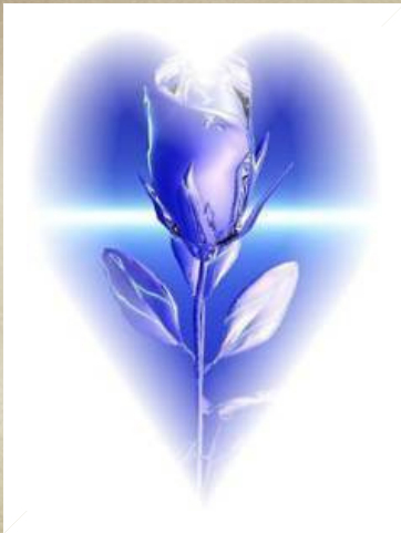
for u babe xxx