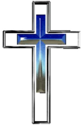
god bless babe